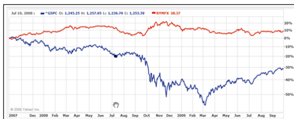
Chart 3: S&P 500 versus selected managed futures fund during recent downturn

We have added the following investments to diversify and hedge portfolios, especially for more conservative clients who desire less short-term volatility: